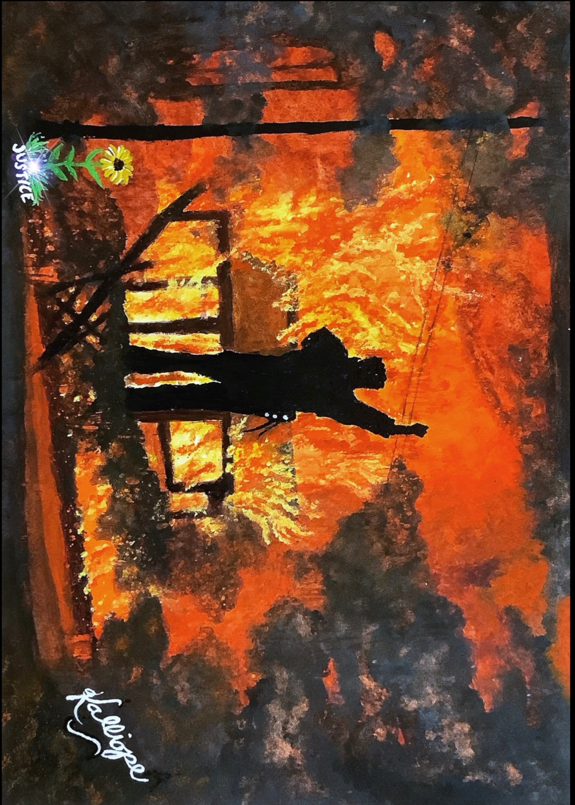
"Transforming Injustice!" A Watercolor Series

Resources: (Images may be enlarged by color photocopying.)