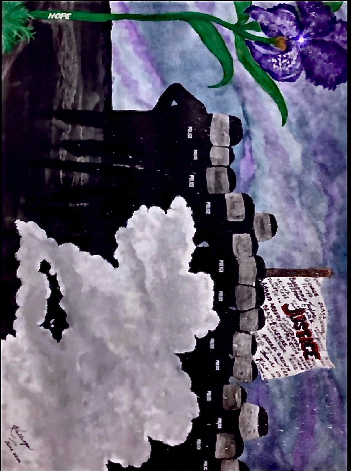
"Transforming Injustice!" A Watercolor Series Watercolor #2: "Riot Gear, Projectiles, Tear Gas and Tears!"

Resources: (Images may be photocopied to enlarge for in-person sessions.)