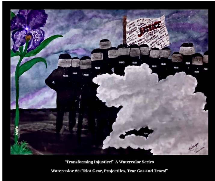
"Transforming Injustice!" A Watercolor Series

“Riot Gear, Projectiles, Tear Gas and Tears.”